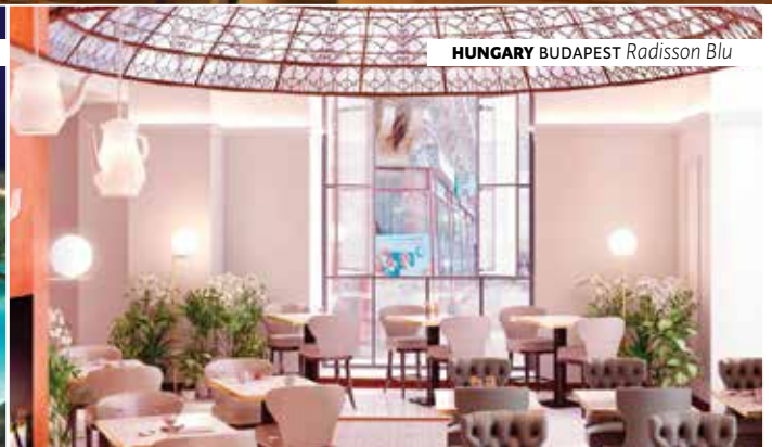
HUNGARY BUDAPEST Radisson Blu