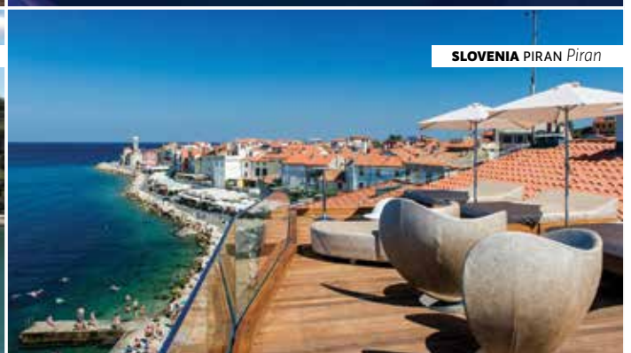
SLOVENIA PIRAN Piran