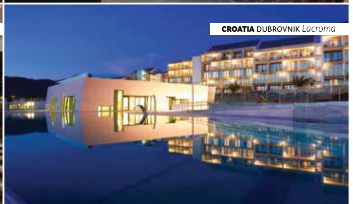
CROATIA DUBROVNIK Lacroma