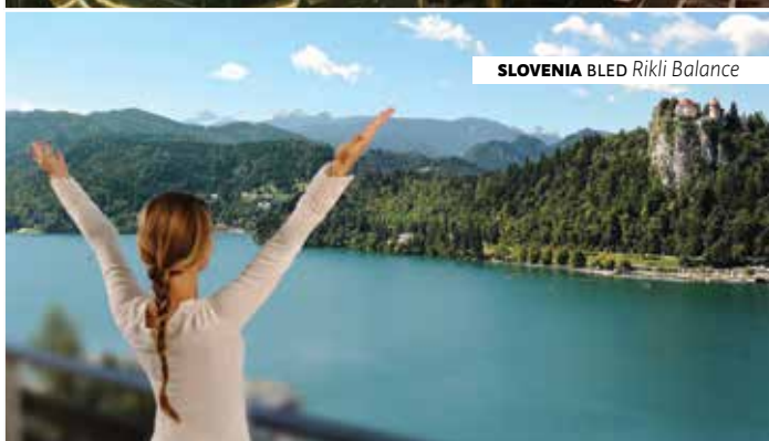
SLOVENIA BLED Rikli Balance