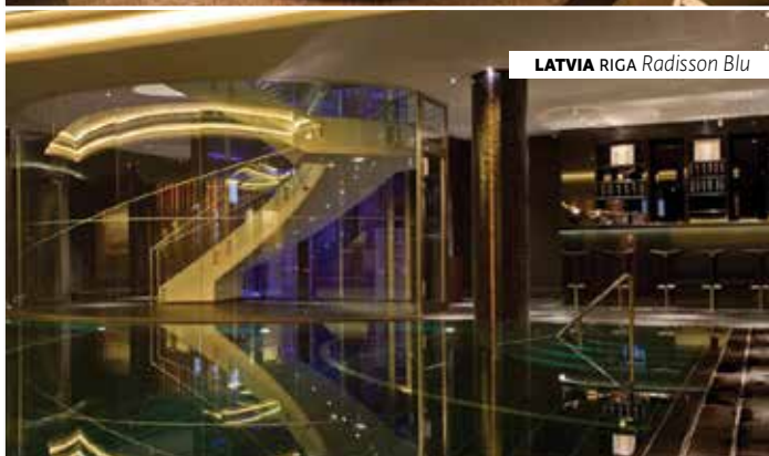
LATVIA RIGA Radisson Blu