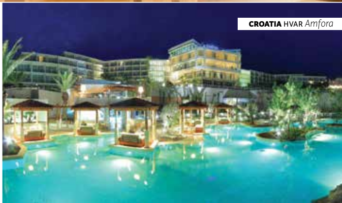
CROATIA HVAR Amfora