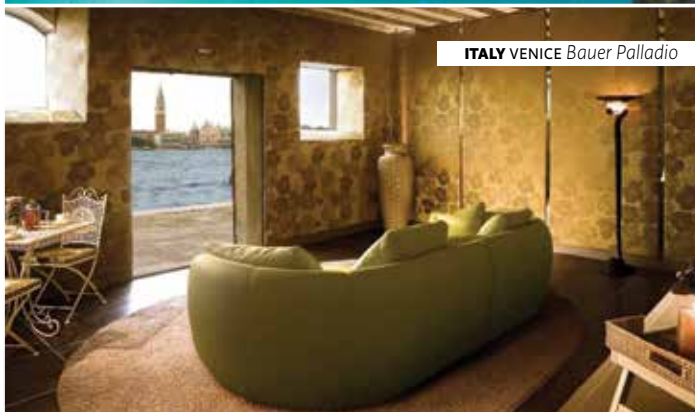
ITALY VENICE Bauer Palladio