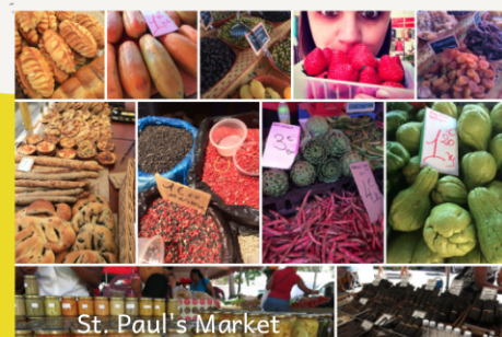
St. Paul's Market