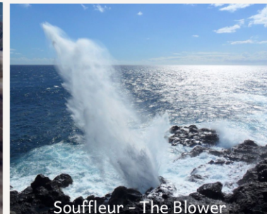
Souffleur - The Blower