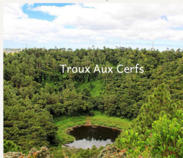
Trou Aux Cerfs

Make the most of your time in Mauritius with this sightseeing experience. The journey starts with the visit to Curepipe: 2nd largest city of the island centrally situated and also known as “La Ville Lumiere” since it was the first town in the island to run on electricity. Climb to the upper plateau for a stunning panoramic view of the island from the top of Trou aux Cerfs, a dormant volcano. As we drive southwards to Chamarel for a visit and lunch stop at a rum distillery, you will enjoy the breathtaking landscape adorning the sacred lake of Grand Bassin and the Black River Gorges National Park. In the afternoon, you will discover the natural treasures of Chamarel, including the unusual geological phenomenon of the Seven-Colored Earth and a spectacular waterfall. Dinner at the resort.