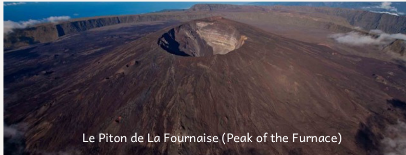
Le Piton de La Fournaise (Peak of the Furnace)