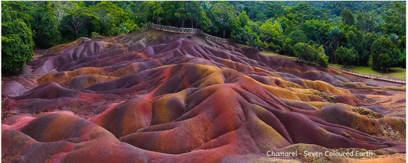
Chamarel – Seven Coloured Earth

Departure every Saturdays, travel until 31 October 2018